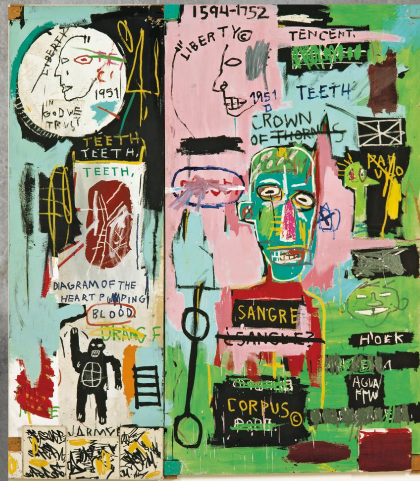
Jean-Michel Basquiat, In Italian (1983)

IT IS THE SAME FOR DOM PÉRIGNON, whose ambition is to inspire the world to elevation through the creation of unique vintages.